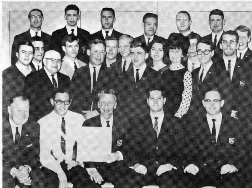
Group Picture of the Corvette Club of Iowa