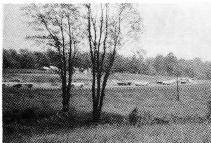
"Plenty of Room"

very formidable C/P cars. This can be summed up as—those Stingers really run.